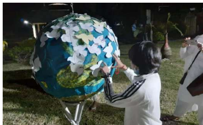
Symbolical decoration of the earth with peace doves