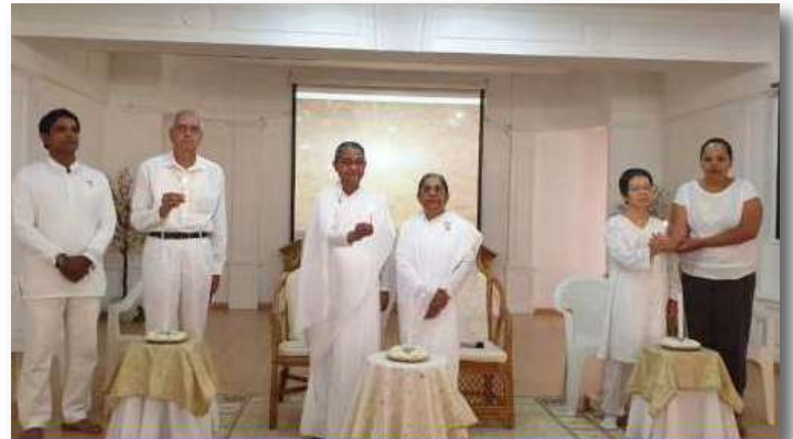
A candle reminded the participants that Peace can light the path of others