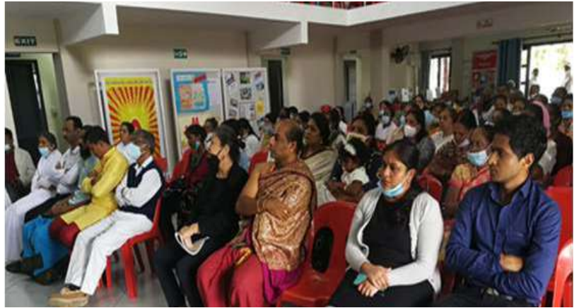
Audience at the Social Security Centre