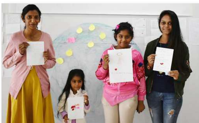
Youth and Children participating in Peace Expression activities at Wooton