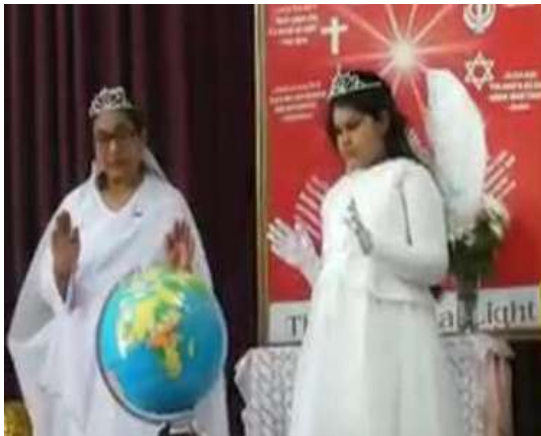
Drama depicting Angels showering Peace on earth