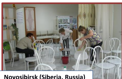
Novosibirsk (Siberia, Russia)