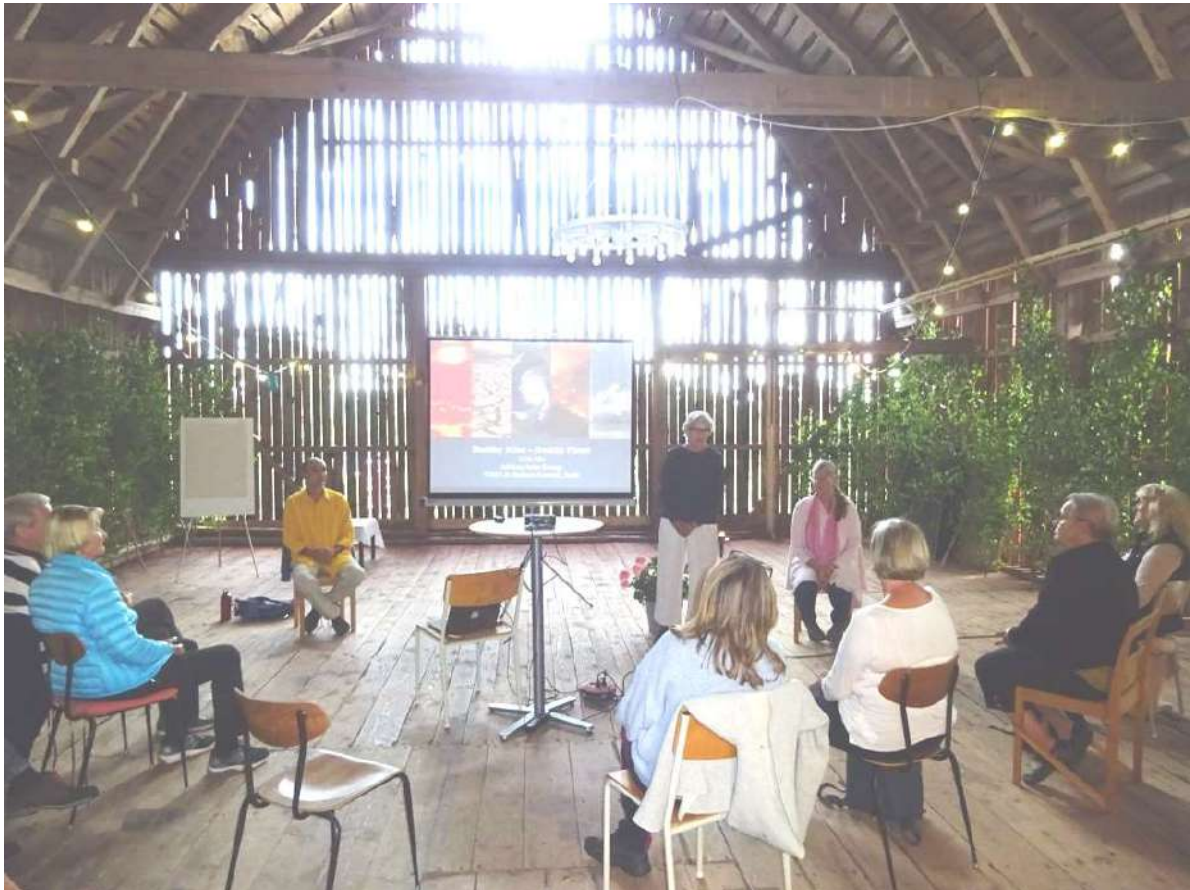
The farmhouse barn transformed to lecture hall, Sweden.