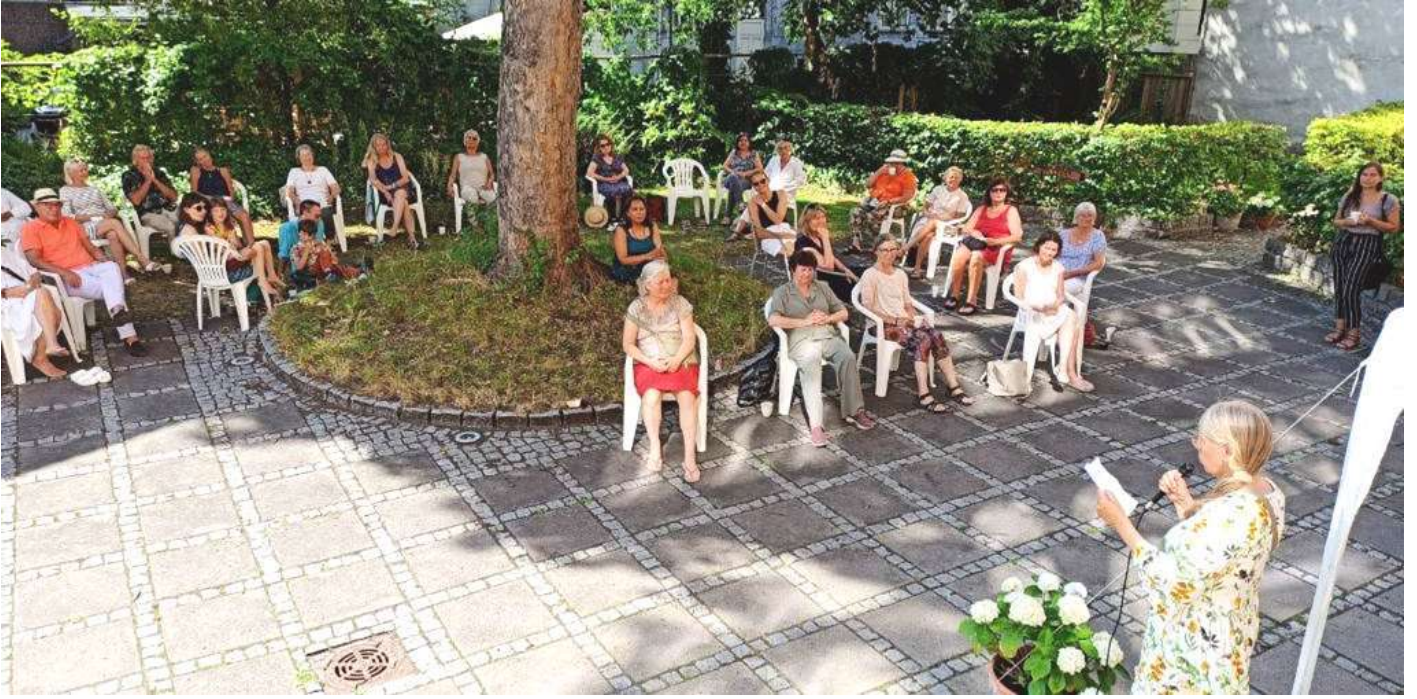
13/8 Vilnius, Lithuania