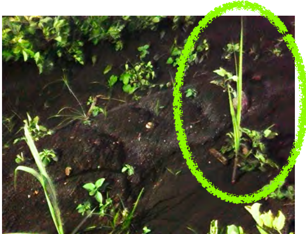
Yugic sugar cane sapling (21 days/ 20cm in height)