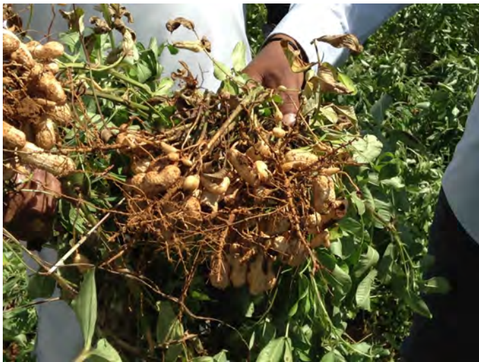
Freshly picked SYA groundnut (peanut)

We then visited a sugar cane crop being looked after by two brothers. Fortunately, we were able to contrast the yogic sugar cane with an adjoining crop of chemical sugar cane managed by the uncle of one of the brothers. The tastes of each were completely different. Both delicious, but the yogic crops certainly had an unmistakable clarity in the taste. Notably, the chemical crops were more prone to flattening during flooding than the yogic crops which remained more upright.