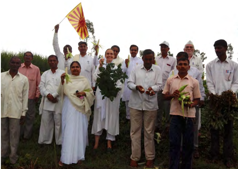
Tour group with SYA farmers. The farmer of this land, which included sugar cane, soya beans, and

We then met a mother farmer in Anjuna who farms with two neighbor brothers, and his farmed all her life. She recently transferred from chemical to SYA. "Good result so far," she says. She is waiting to see the final result before committing to a complete change to SYA.