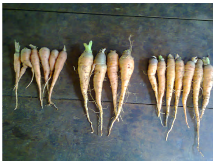
Chemical carrots (L), Yogic carrots (C), Organic carrots (R)