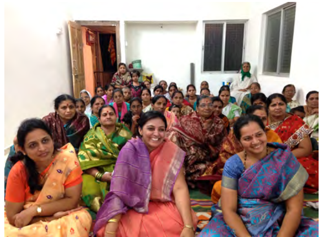
Centre in Nagav. Meeting sisters, mothers and kumaris

Later that evening we met with a group of about 40 mothers, sisters and kumaris at the centre in Nagav, to introduce yogic farming methods. They were very interested and many knew at least one person who was experimenting with SYA.