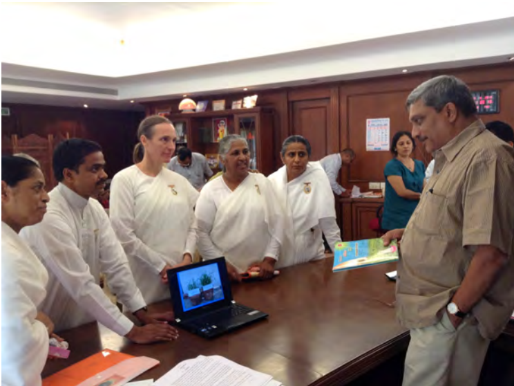
Brothers and sisters meeting with Chief Minister of Goa, presenting SYA.

We visited the Department of Agriculture, Government of Goa, and the Director and Deputy Director of Agriculture took us on a tour of SYA plots. We then inaugurated the SYA training room, dedicated for SYA training. There was a full audience and a complement of news media in attendance.