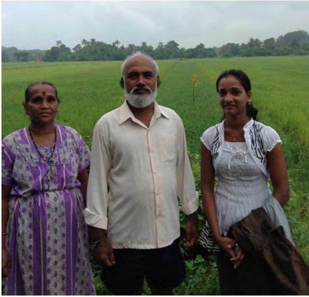
Young female farmer (R) with family members near Anjuna village. Yogic crop in background.

SYA training. We went to the training cottage and met with 9 brothers and 5 mothers, all of whom are learning SYA methods... The sisters say that there is a bird who flies in whenever sisters are reading murli and teaching SYA. He flew in when we were there and circled around the head of each of us in turn!