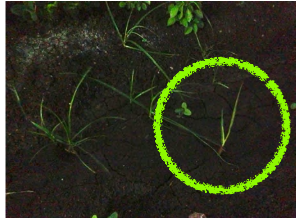
Chemical sugar cane sapling (21 days/ 6cm in height)