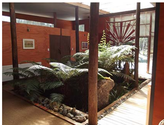
The hall to access the bathrooms

In the evenings guests went back to their respective bungalows which accommodate up to three people each, with a peaceful heart and a contented mind.