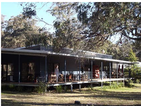
The main bungalow with meeting hall and kitchen

In the Aravali Meditation Sanctuary the 'green' foreigners were in ecstasy listening to the laughing kookaburras and watching the beautiful currawongs and crimson rosellas.