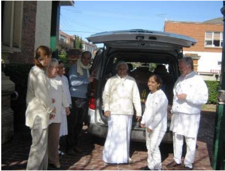
Leaving Ashfield centre