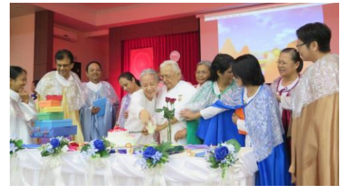
Cake cutting with Didi