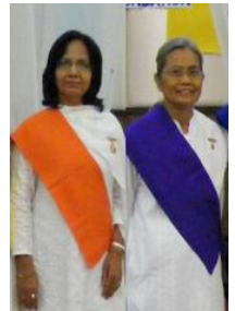
Sr.Prapa and Sr.Asha - main instruments taking care of Didi's Diet.

A young woman in a white wedding dress is holding a bouquet of blue and white flowers. She has a floral crown on her head and a yellow pin on her dress. In the background, other people in white wedding attire are visible.