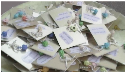
Registration's done with different titles and small colourful crowns to pin on everyone.