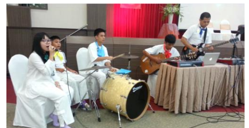
Song of Love played by our youth band.