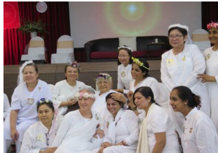
To be close to senior is to be close to Baba