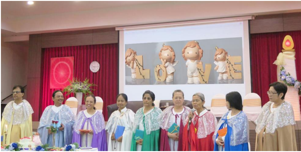
The main instruments from different centres: Chiangmai, Pattani, BKK/Ladpao and Sukhumvit and Nakhonpathom turned to be colourful butterflies choosing favorite colour note books as a gift. They went around to share different seeds/nut of love.