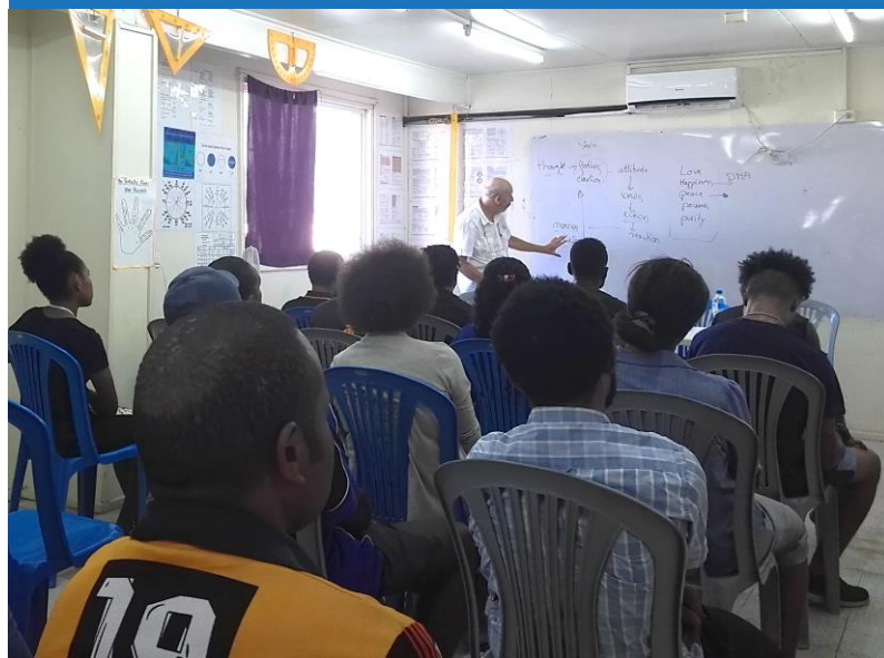
↑ Athletes at Gejah Academy for Multiple Martial Arts ↓