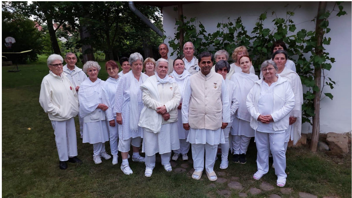
After a silence walk