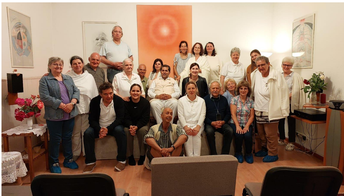
Public program in the centre