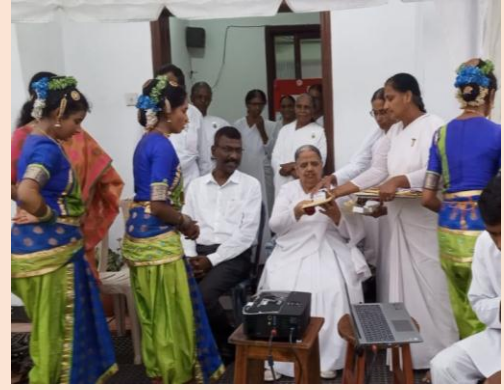
Dance by Sathya Sai Kalalaya students