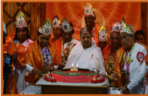
Cake Cutting Ceremony