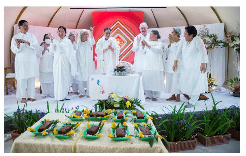
Co-creators of the new world through the launch of the 40th year of Philippine service

As it was the beginning, so it will be at the end. We need to do tapasya as the Dadis did for 14 years as a preparation for what is to come.