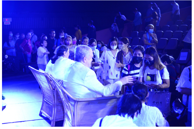
Every guest received toli and a blessing card.

"Be Still, My Heart" was livestreamed at