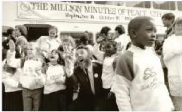
Million Minutes of Peace Appeal (1986)