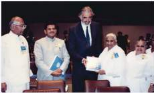
Sharing our Values for a Better World (1994)