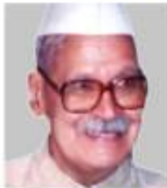
Shri Shankar D. Sharma The then President of India