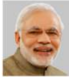
Shri Narendra Modi Prime Minister of India