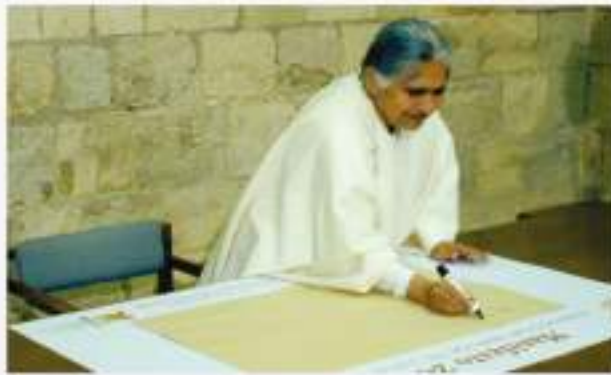
UN Culture of Peace & Non-Violence (2000)