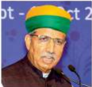
Mr. Arjun Singh Mughwal Union Minister of State, India