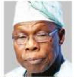
Shri Olusegun Obasanjo Former President of Nigeria