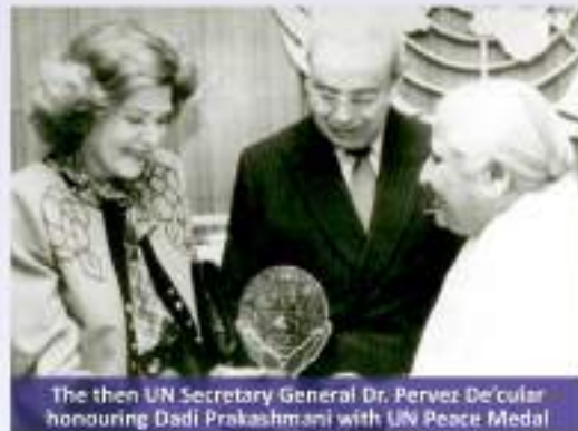
The then UN Secretary General Dr. Perverz De'cular honouring Dadi Prakashmani with UN Peace Medal