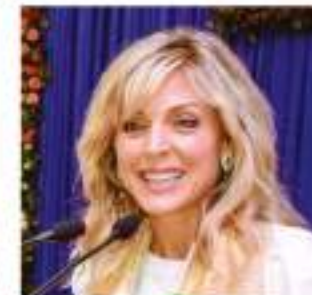
Ms. Maria Maples Actress & TV Personality, USA