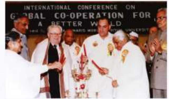
Global Co-operation for a Better World (1988)