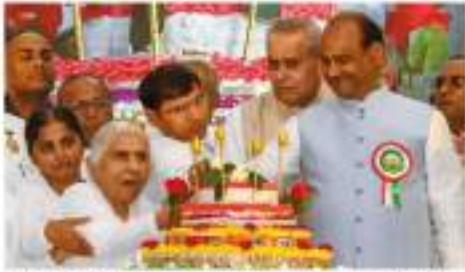
Hon. Speaker of Lok Sabha Shri Om Birla Ji and Rajyogini Dada Janki Ji Cutting the Cake at Global Summit 2019