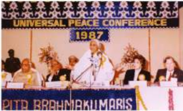
Universal Peace Conferences (1983-87)