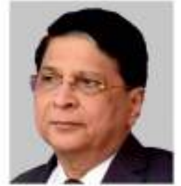
Justice Dipak Misra Former Chief Justice of India