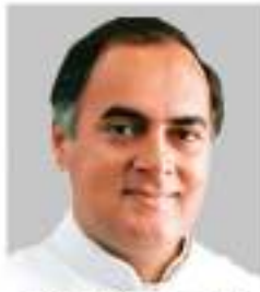
Shri Rajiv Gandhi Former Prime Minister of India