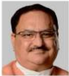
Shri J.P. Nadda President of BJP