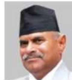
Shri Ram Baran Yadav Former President of Nepal