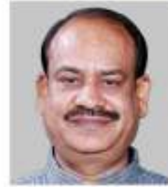
Shri Om Birla Speaker of Lok Sabha