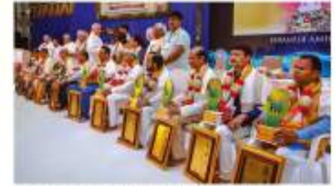
Felicitation of 'Guardians of Nature' who are giving their best to save the environment at Global Summit 2018.