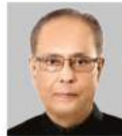
Shri Pranab Mukherjee The then President of India