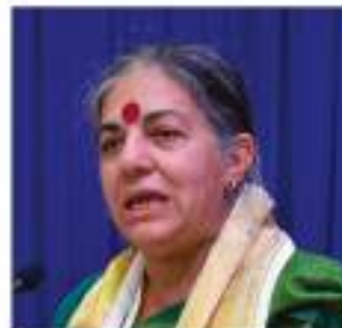
Dr. Vandana Shiva Renowned Environmentalist