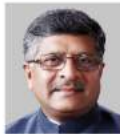
Shri Ravi Shankar Prasad Minister, Govt. of India