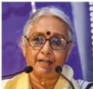
Ms. Aruna Roy Renowned Social Activist