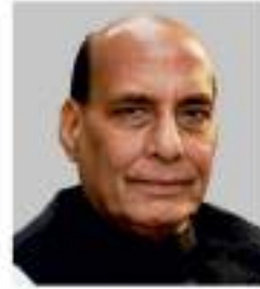
Shri Rajnath Singh Defence Minister of India