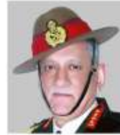
General Bipin Rawat Chief of Defence Staff of India