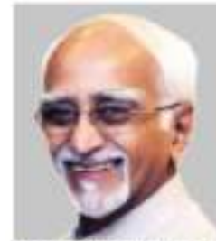
Shri M. Hamid Ansari The then Vice President of India