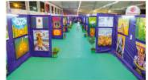
Art Exhibition of Paintings created by around 250 artists on the theme at the Global Summit 2019