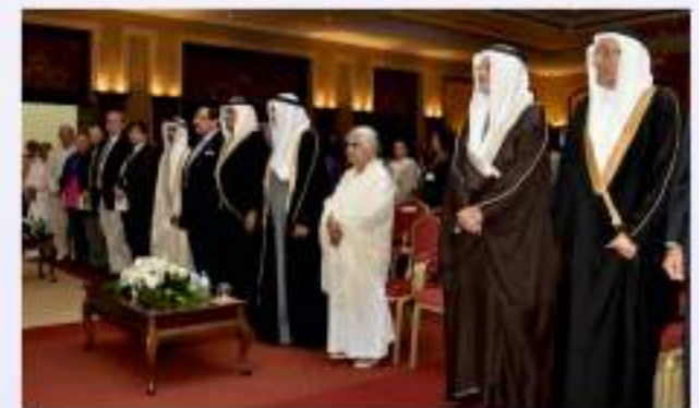
Call of Time Dialogue