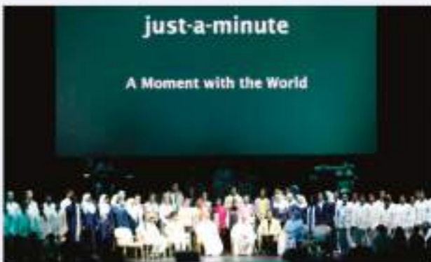
Just A Minute (2006)