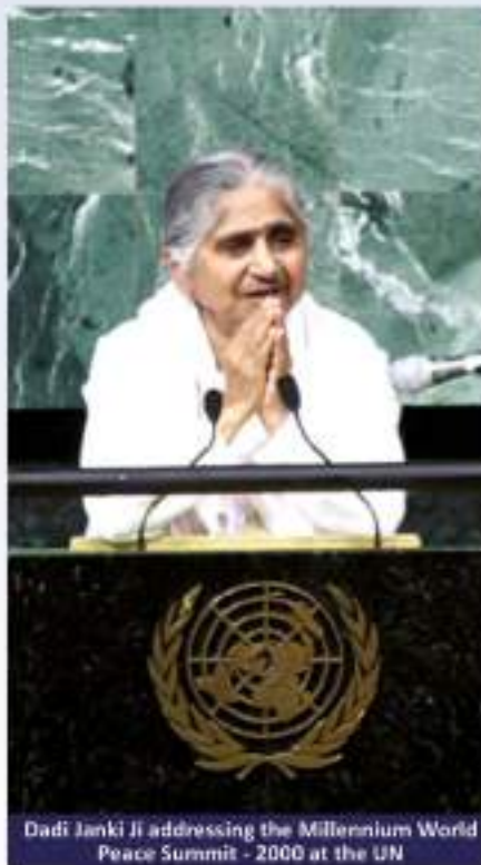
Dadi Janki Ji addressing the Millennium World Peace Summit - 2000 at the UN