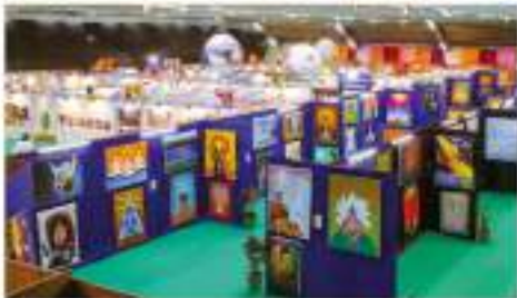
A grand Spiritual Expo organised at the venue during the Global Summit 2019