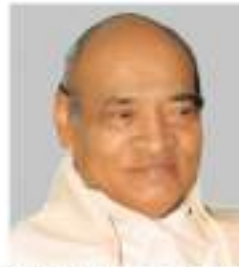
Shri P.V. Narasimha Rao The then Prime Minister of India