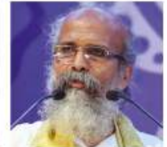
Mr. Pratap Chandra Sarangi Union Minister of State, India