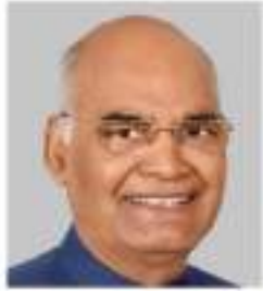
Shri Ramnath Kovind President of India