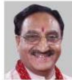
Shri Ramesh Pokhriyal Minister, Govt. of India