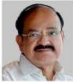
Shri Venkaiah Naidu Vice President of India