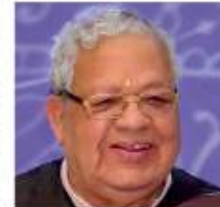
Mr. Kalraj Mishra Governor of Rajasthan