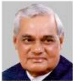
Shri Atal B. Vajpayee The then Prime Minister of India