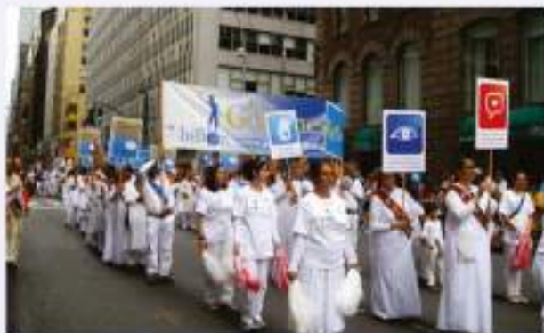
7 Billion Acts of Goodness (2014)