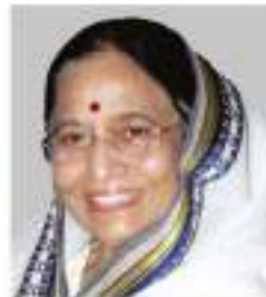
Smt. Pratibha Patil The then President of India