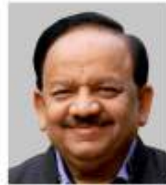
Shri Dr. Harshvardhan Minister, Govt. of India