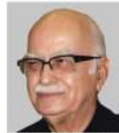
Shri Lal Krishna Advani The then Dp. P.M. of India