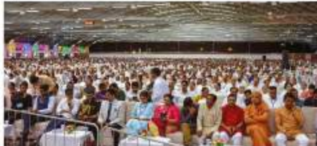
The panoramic view of Gathering of Global Summit 2019 at huge Diamond Hall of Shantivan Campus.