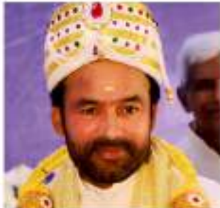
Mr. G Kishan Reddy Union Minister of State, India