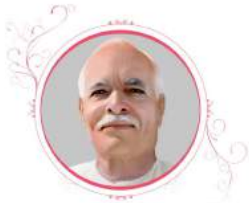
Prajapita Brahma Founding Father