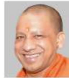
Shri Yogi Adityanath Chief Minister of UP