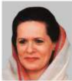
Smt. Sonia Gandhi President of INC