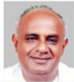
Shri H.D. Deve Gowda The then Prime Minister of India