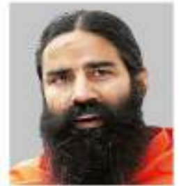
Swami Ramdev Ji Spiritual Guru