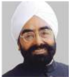
Shri Gyani Zail Singh The then President of India