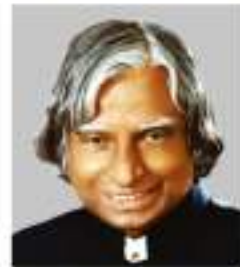
Shri APJ Abdul Kalam The then President of India