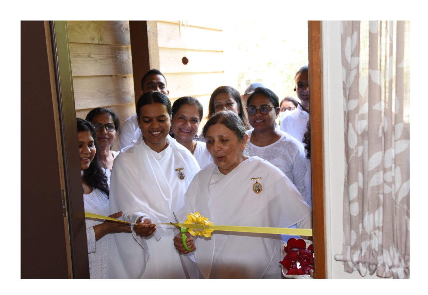
Ribbon cutting -Kitchen and Kalaben entering Peace Villa.