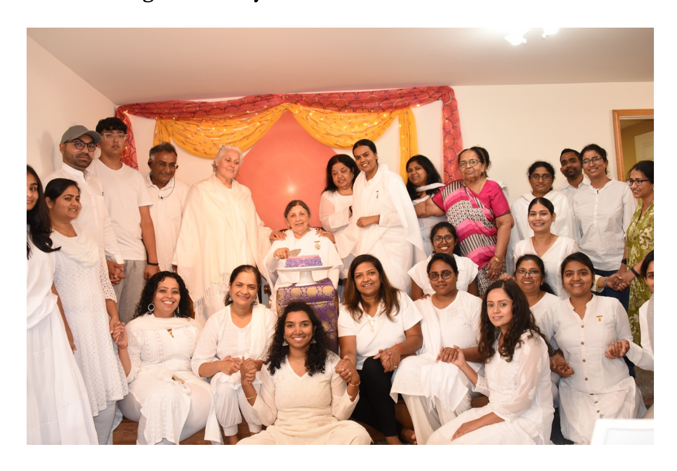
Bhog offering to sweet Bapdada.