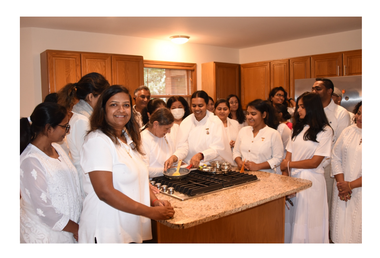
House Tour of "Peace Villa" followed by Shiv Baba sticker in the basement entrance door.