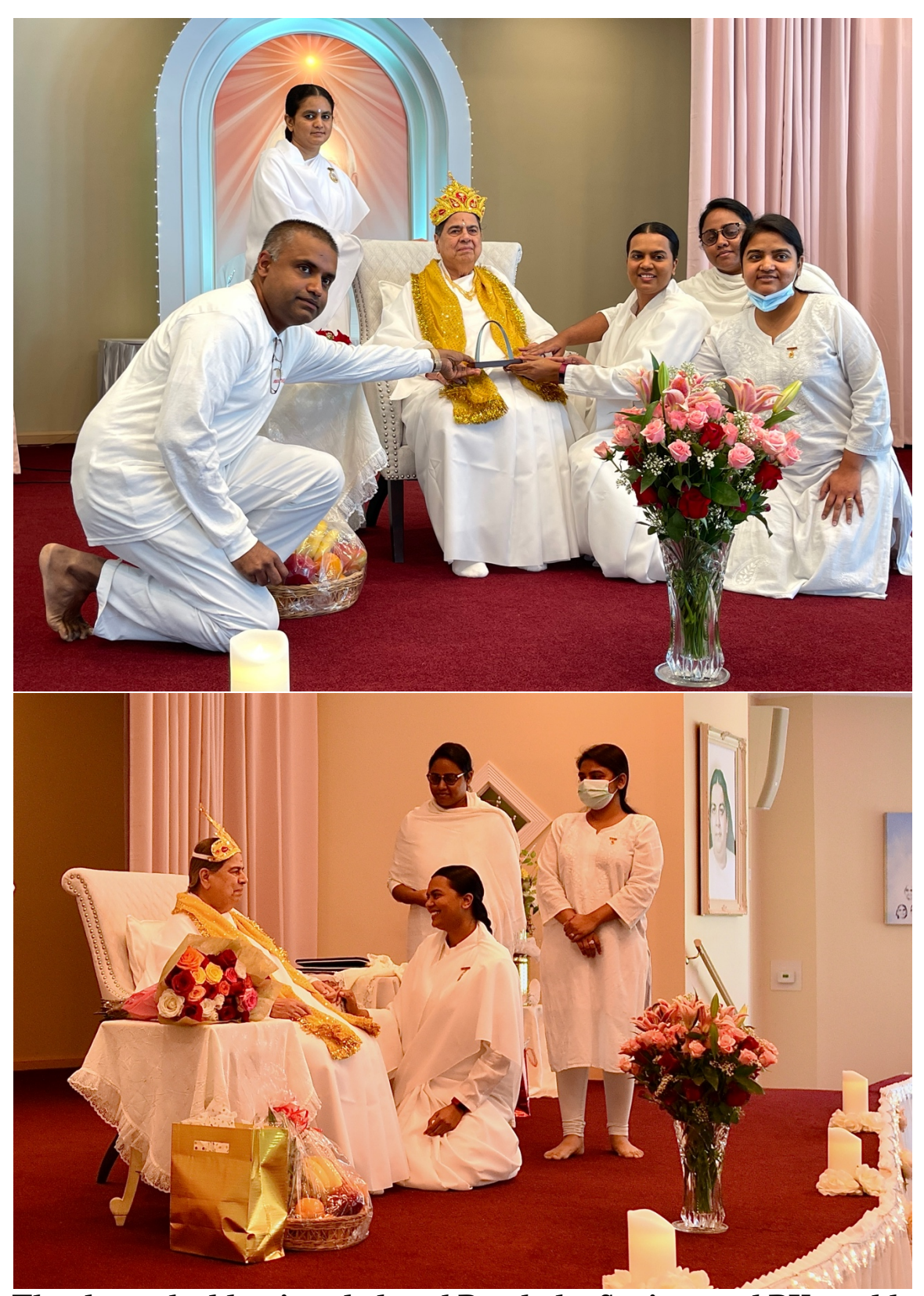
Thanks to the blessings beloved Bapdada, Seniors and BK world family. Om shanti!