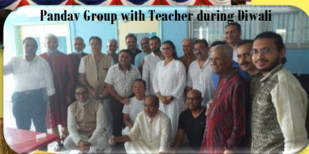
Pandav Group with Teacher during Diwali