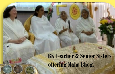
BK Teacher & Senior Sisters offering Maha Bhog.