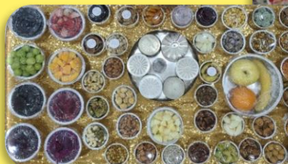
More than 50 items prepared for Maha Bhog.