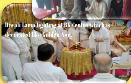
Diwali Lamp Lighting at BK Centre which is decorated like Golden Age.

Given the momentous milestone completion, this year the Spiritual Diwali celebration was held in two parts. One part was held outside the centre – at a well-known school in Hong Kong. The program, conducted with grand fervor had a mix of meditation, cultural programs from various parts of the world, spiritual games and distribution of Blessings and Toli. The icing on the cake was the entire Brahmin family coming together to partake the Brahma Bhojan (food prepared spiritually).