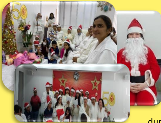
Christmas family gathering, Senior BK Sister as Santa and Baba's songs sung as a Choir.

This year, the uniqueness of the Christmas celebration was that a parallel was drawn between the knowledge in the Bible and Baba's knowledge. It was shown how Baba's knowledge maps on to the various aspects of Christmas like the Christmas tree, Santa Claus, timing of Christmas, etc. At the same time as it was interesting, the Brahmin family members got to understand how to relate Baba's knowledge to their Christian acquaintances – a valuable skill during Confluence Age.