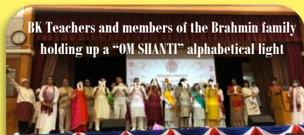
BK Teachers and members of the Brahmin family holding up a "OM SHANTI" alphabetical light