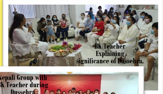
BK Teacher Explaining significance of Dussehra.

To celebrate their biggest festival, the Nepali BK community of Hong Kong came-together on Dussehra. Conducted at the Kowloon premises of the Raja Yoga Centre, the key highlight of the session was a discourse on the significance of this festival in Nepal, where it is called Dashain which celebrates the victory of good over evil. It is believed that on this day the Goddess Durga defeated the demon Mahishasura. The spiritual significance associated with this belief was discussed during the BK event.