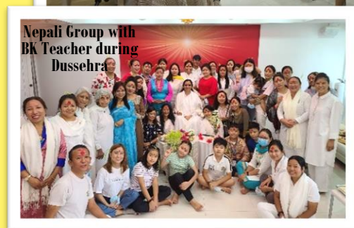
Nepali Group with BK Teacher during Dussehra