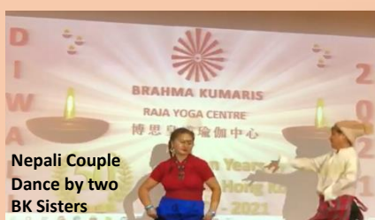
Nepali Couple Dance by two BK Sisters

This year’s Diwali celebrations were accentuated by several cultural performances from various parts of the world.