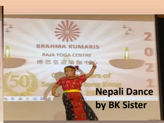
Nepali Dance by BK Sister

Dances from Nepal sang praises of nature during unique festive seasons such as Diwali.