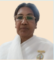
BK Sarala Telugu Department

campus is in harmony with nature using natural resources like solar energy for cooking and electricity. The campus aims at developing a holistic personality of individuals by empowering them to inculcate higher order values of life and providing the training in Rajyoga Meditation, which is truly inspiring and unique in its own. I am fortunate that I got the chance to visit this campus and I am taking the positive energy back with me.”