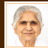
Rev. Dr. Dadi Janki ji Chief of Brahma Kumaris