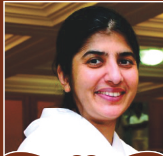
Sis. BK Shivani

Associated with Brahma Kumaris for 50+ years, popular TV personality with Samadhan Series & participated in 100s of national and international conferences.