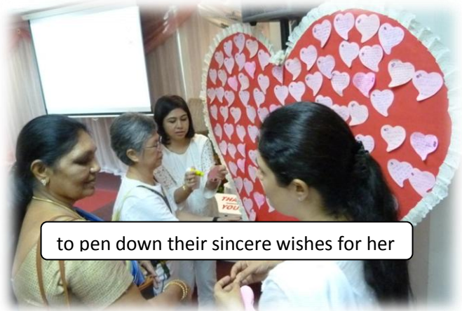
to pen down their sincere wishes for her