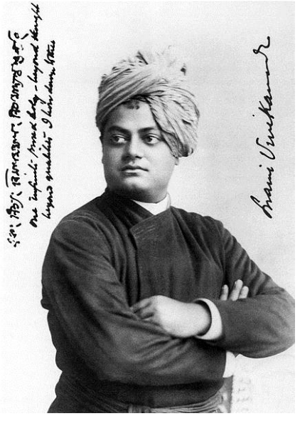
Vivekananda in Chicago, September 1893. On the left, Vivekananda wrote: "one infinite pure and holy – beyond thought beyond qualities I bow down to