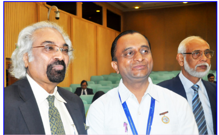
Mr. Sam Pitroda, Chairman, National Innovation Council, Delhi