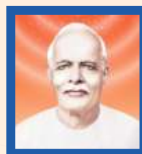
Prajapita Brahma Corporeal medium of God Shiva

The Conference is organised by Spiritual Applications Research Centre (SpARC Wing) of Rajyoga Education and Research Foundation (RERF) along with parent organisation – Brahma Kumaris. SpARC Wing was established in 1995 and operates as a research wing carrying out holistic research to develop effective tools and techniques to facilitate application of spirituality