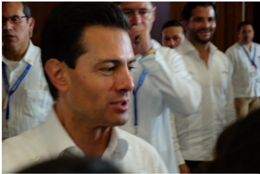
Picture 2. Enrique Peña Nieto, President of Mexico, leaving the premises after the opening ceremony.

The Mexican president welcomed the delegates. He encouraged them to learn from the past and work together to preserve the biodiversity of the world. He reminded everyone that to preserve this diversity is not only the correct thing to do, it is also ethical and moral. He ended his speech saying: "We need to change our ways of living to preserve the biodiversity or else the loss of biodiversity will change our ways of living forever".