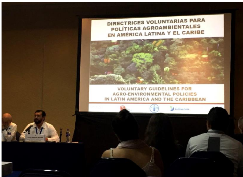
Picture 4. Ministers from the Mexican government.

The discussions continue and many interesting events will take place in the coming days.