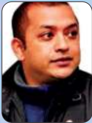
Gagan Kumar Thapa Honourable Member Constitutional Assembly

"Moral value is the future power. Yoga and meditation will help and Spirituality has a bright future."